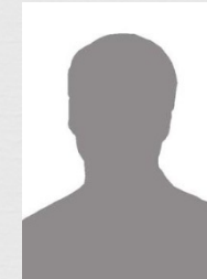
Coming Soon - East Texas