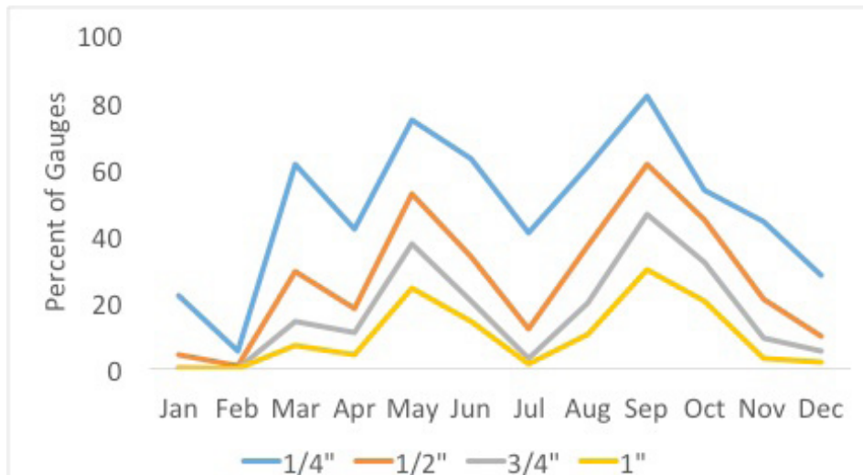
Figure 2. Percent of gauges within 3 miles of each other that differed by ¼”, ½”, ¾”, and 1” during each month of the year. Example: During September, 80% of gauges had measurements that differed by a quarter inch.

The relatively high variation among gauges during the rainy season indicates most rainfall events at this time were localized (Fig. 3). During April-June and August-October, there may be value in having multiple rainfall gauges distributed across the ranch at a scale that meets ranch-specific management goals. Further, one should not assume rainfall measured from a single gauge reflects rainfall that occurred ranch-wide. During winter (Dec-Feb), gauge measurements were relatively consistent which indicates that rainfall events were usually wide-ranging, probably associated with “cold” fronts from the North. Instead of recording redundant data from multiple gauges during winter, our analysis suggests you would be justified reading a single gauge outside of your window while standing by the fireplace with a cup of hot coffee.