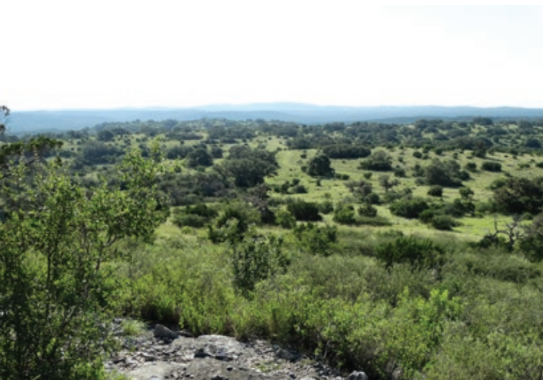
Figure 3. Montezuma quail habitat in the Edwards Plateau. Although we have documented these quail using a variety of plant community assemblages, generally, Montezuma quail habitat is described as rolling or steep upland, oak-juniper-pinon savannah with good grass cover and plentiful forbs.