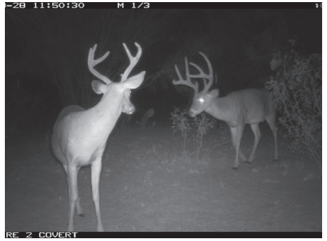
Individual bucks can be identified by unique characteristics of their antlers during camera surveys, day or night.

Most camera surveys are done at feeder sites or over bait piles. A delay of 3 to 5 minutes between photos will make reviewing of the photos more efficient.