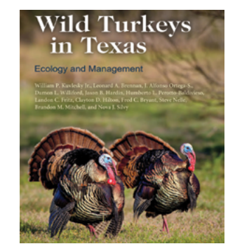
A new book on wild turkeys in Texas will be available this summer from the Texas A&M University Press.

Finally, when one considers that wild turkeys are such an iconic