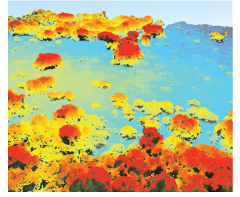
A 3D representation of tree canopy height made possible using drones.

Drones (often referred to as unmanned aerial vehicles) are remotely controlled robotic vehicles that have grown in popularity over the last few decades. The development of these remote sensing platforms with very high spatial and temporal resolution provides opportunities to gather new information from the field and new insights