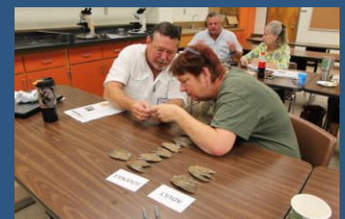
Educators aging quail wings.