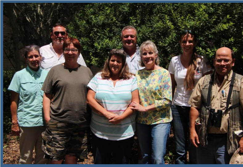
Participating educators at the 1 st Bird Conservation Curriculum Workshop