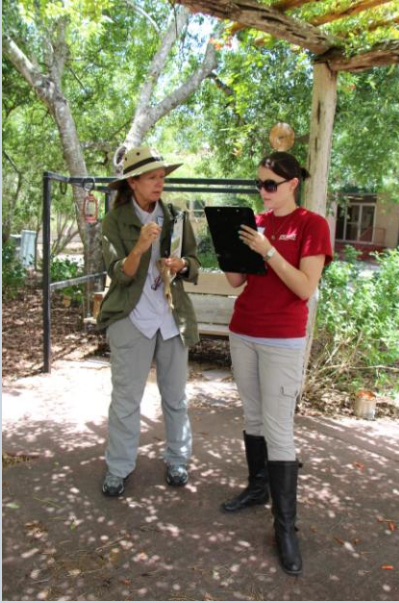
Educators practicing bird handling during the mist-netting activity.