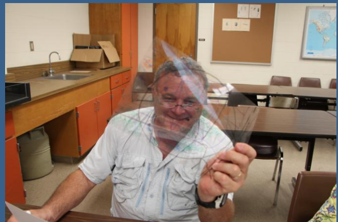
Educators creating a classification map of their quail's home range.