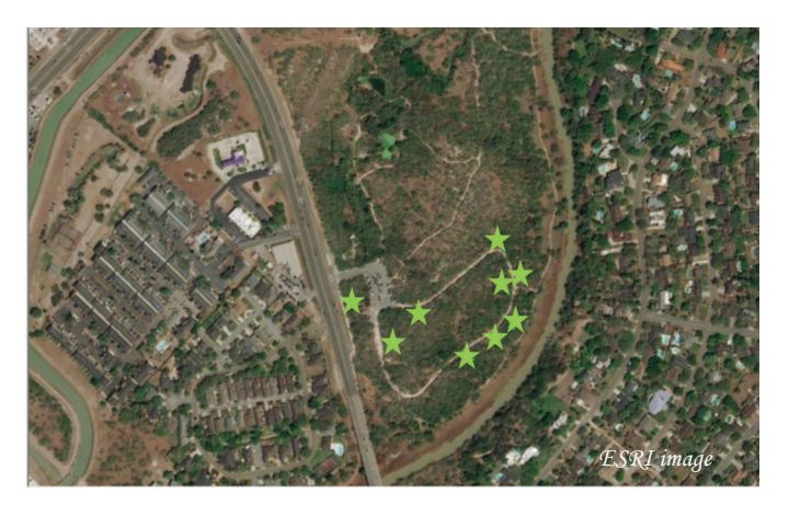
Aerial view of Hugh Ramsey Nature Park in Harlingen, Texas. Green stars indicate active restoration sites.

This research suggests that city parks can function as important sources of habitat for this long-lived species, even when located within areas of high urban density. Additionally, we saw that restoration efforts and promotion of native plant species were effective strategies for maintaining habitat for tortoises. As cities continue to grow in the Rio Grande Valley, ensuring that parks maintain spatial connections with each other (through possible greenways) will be important for maintaining habitat for this threatened reptile. ~