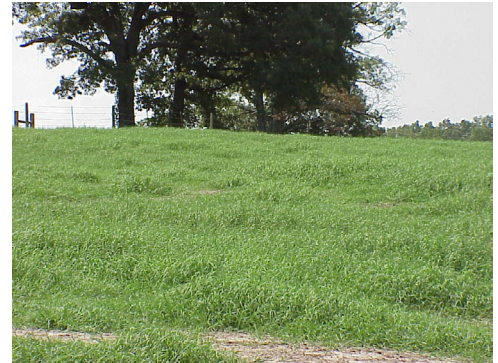
Figure 5. Stages of a bermudagrass planting from early June through late August.

any, input costs associated with fertilizer and herbicide.