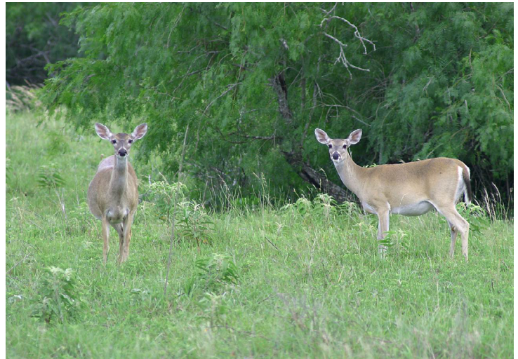
Figure 2. Wildlife species, such as white-tailed deer benefit from a diversity of plants in the pasture.