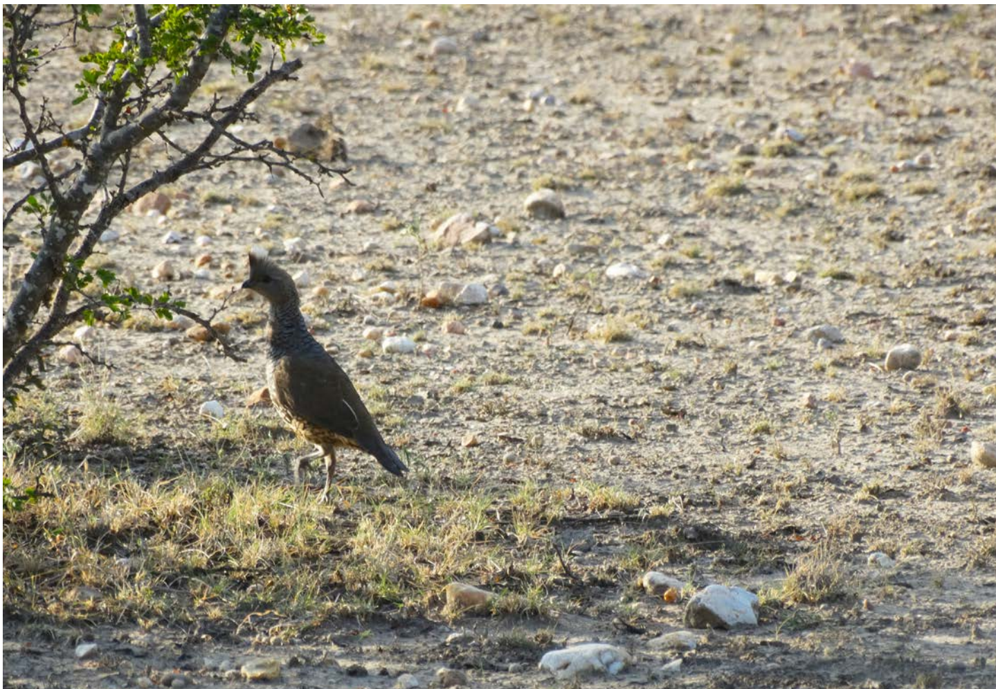
Figure 1. Scaled quail are almost always found within the shade-cast of shrubs in South Texas. These microsites provide lower ground surface and black globe temperatures.

energetic cost for regulating body temperature and critical chemical processes may be hindered within the body when temperatures are outside of this range. When considering sites that scaled quail use for foraging and loafing, both ground surface and black globe temperatures were important, but this importance varied by time of day. During early morning and late afternoon (times of day with cooler temperatures and long shade-casts), selection for sites with cooler microclimates were not as important. However, during the warmest times of the day, late morning and early afternoon, scaled quail sought cooler locations than were randomly available across their habitat. The probability of use of a given site for foraging or loafing decreased about 10% for every 1% increase in ground surface temperature.